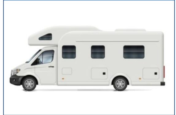
Side View (Passenger's side)