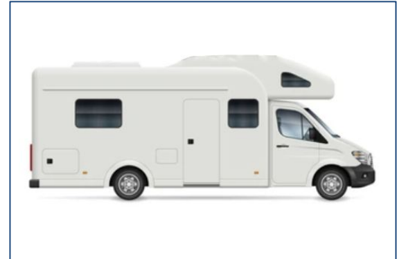
Side View (Driver's side)